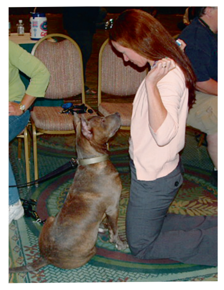
Teaching "sit" and "look" to a dog in laboratory class. Notice that the human moved closer and lower (by kneeling) to this dog to keep the dog focused on her. The dog is about to be given a treat which is enclosed in the human's left hand (a clicker is in the right hand).

"Bonnie—sit—(3-second pause)—sit—(3-second pause)—Bonnie, sit, look—(move closer to dog and move treat to your eye to encourage her to track the treat to your eye and "look")—sit—good girl! (treat)—stay—good girl—stay (take a step backward while saying "stay"—then stop)—stay Bonnie—good girl—stay (return while saying "stay"—then stop)—stay Bonnie—good girl (treat)—okay (the releaser and she can get up)!"